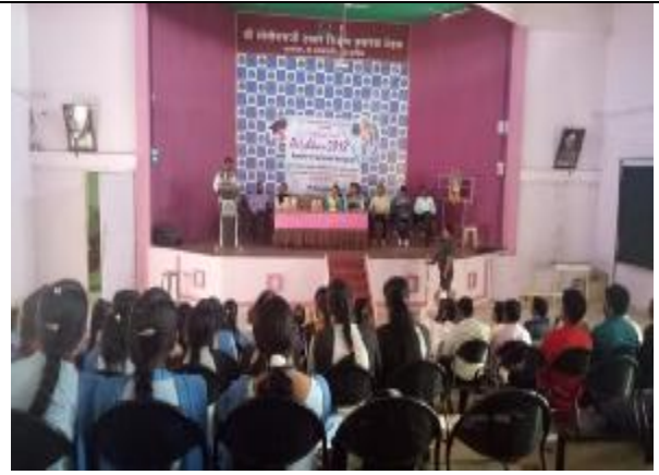
Washim District Avishkar