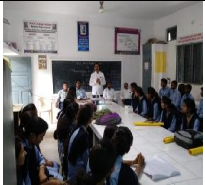
Principal Introducing District Coordinator of Avishkar competition