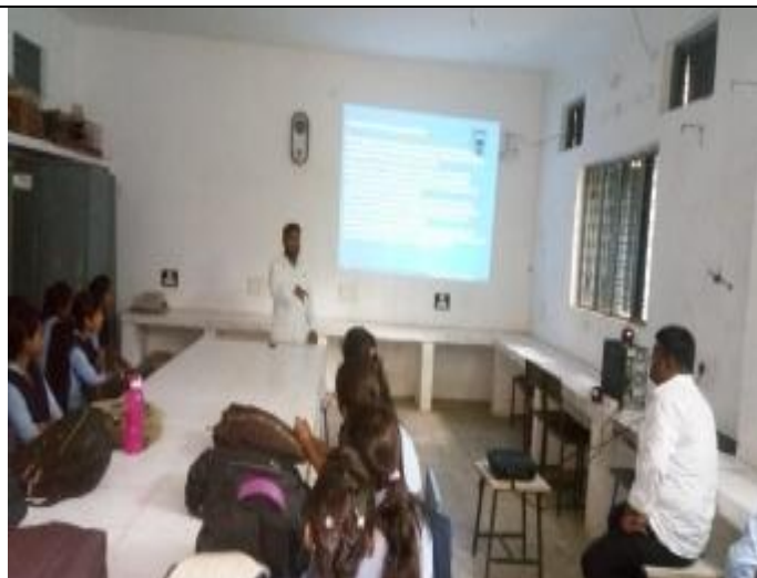
Teacher Coordinator addressing the students

Under Incubation Center Research Committee organized the Workshop "Preparation For Avishkar competition" for creation of research temper among the students on 14/09/2018.