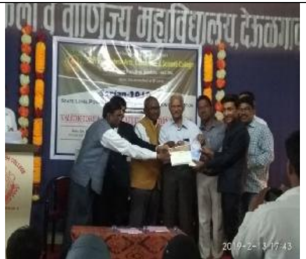
First Priz in State Level Ppt. Presentation Deulgoan Raja