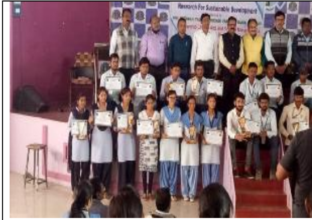
Winner of the Avishkar