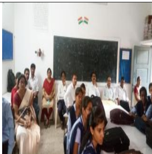
Concerning teachers and Students