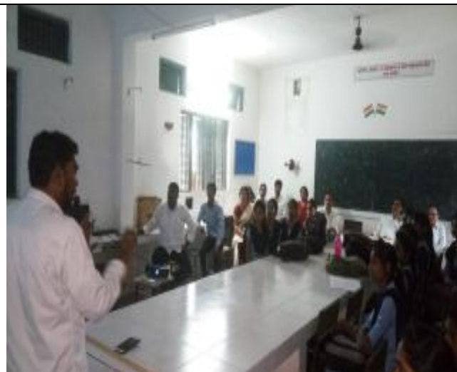
Faculty members observing rules