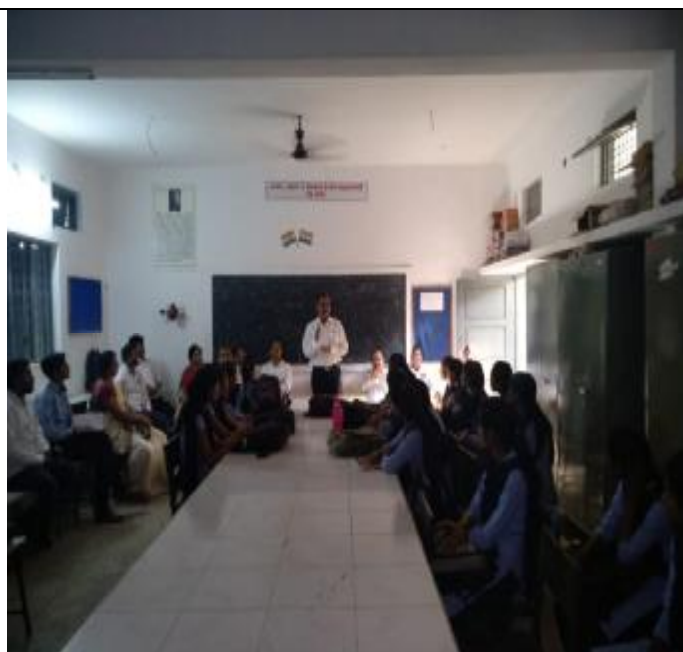
Principal & chairman of Incubation Centre addressing the Students