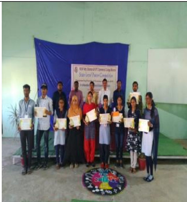
Students Participated in State level Poster Competition