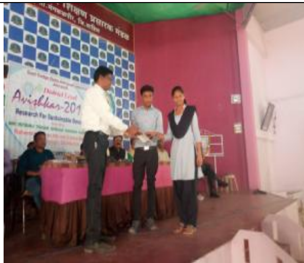
First Rank at District Level Avishkar Washim District