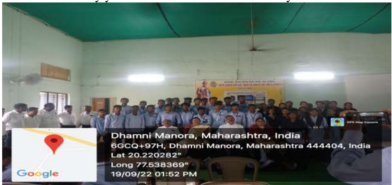
Entry year students of Art Faculty