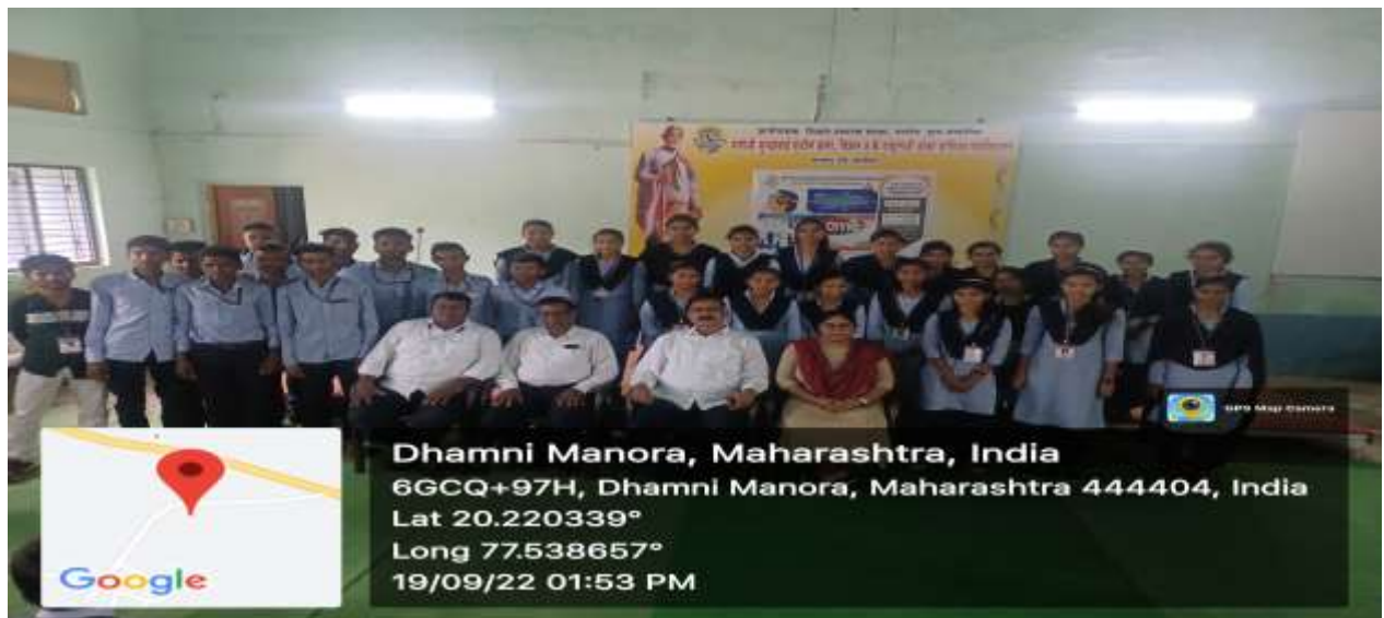
Entry year students of Commerce Faculty