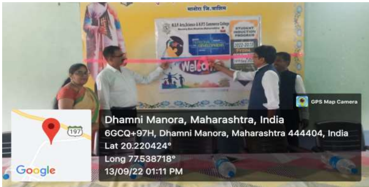
Inauguration of Induction Program