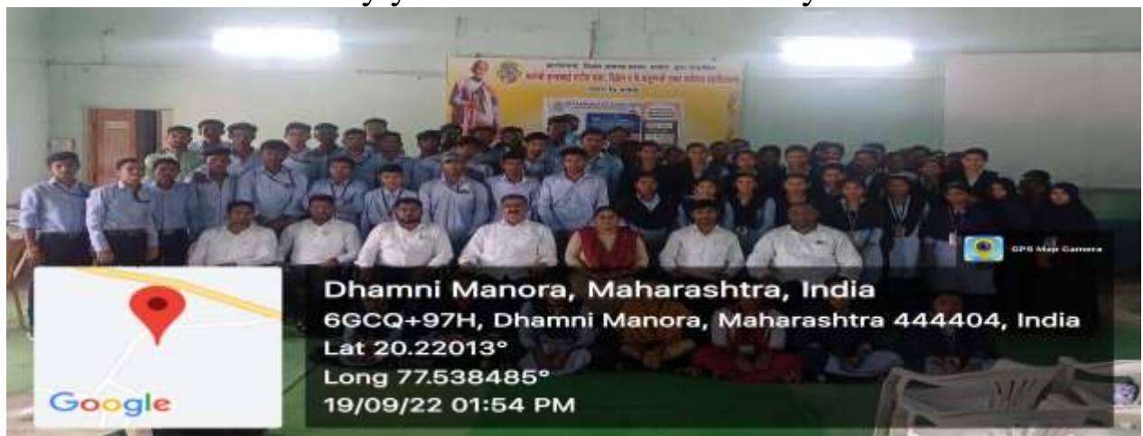
Entry year students of Art Faculty