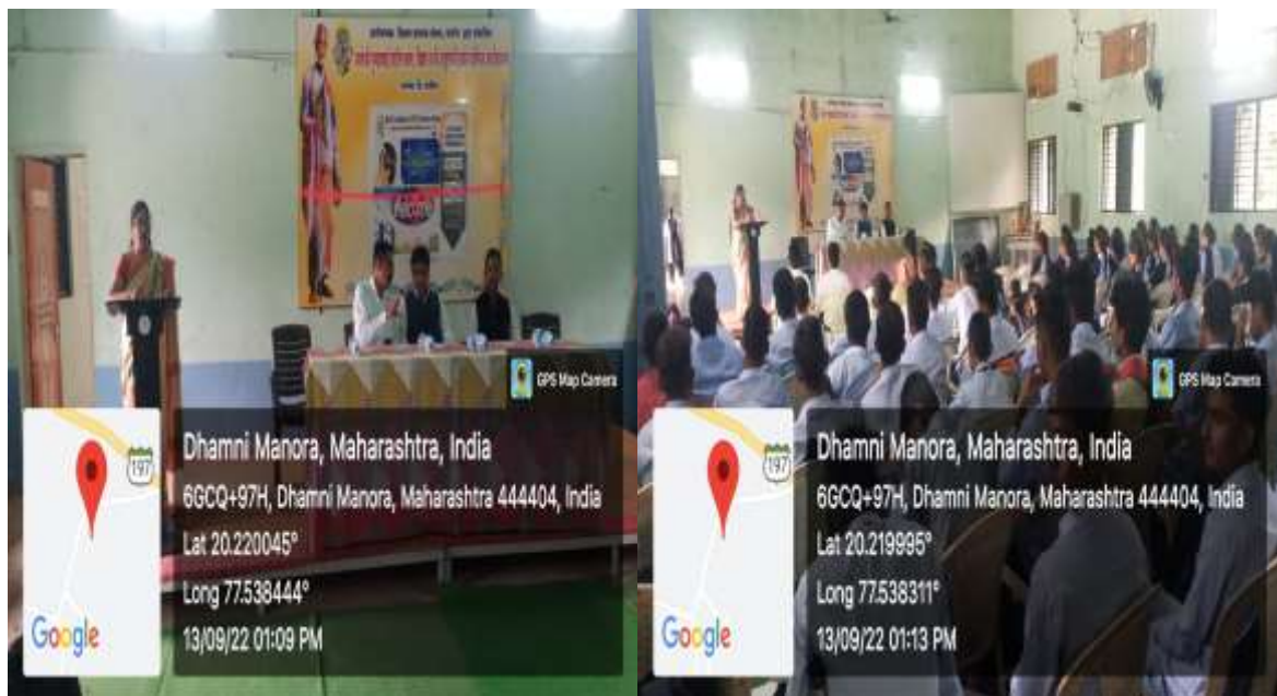
Introduction of Chief Guests