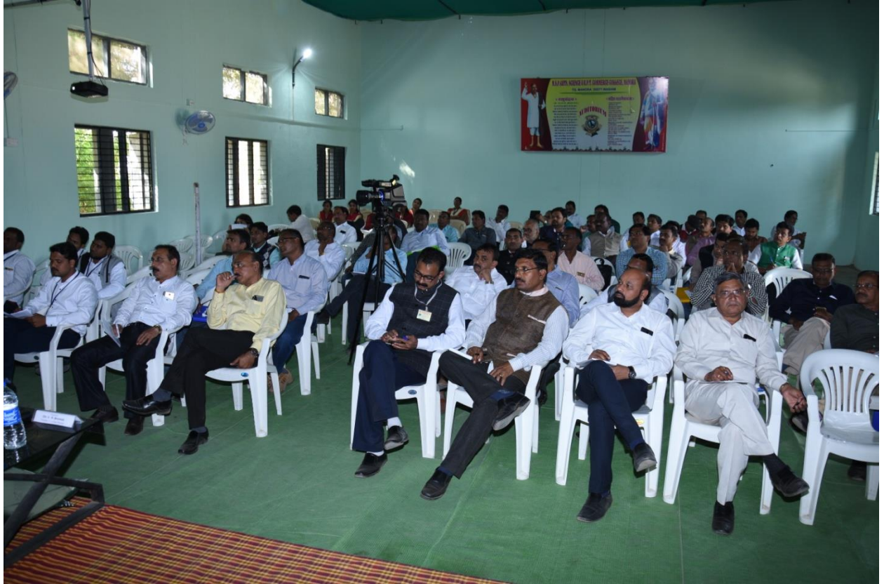
Participants listening to the Resource Person in the seminar.