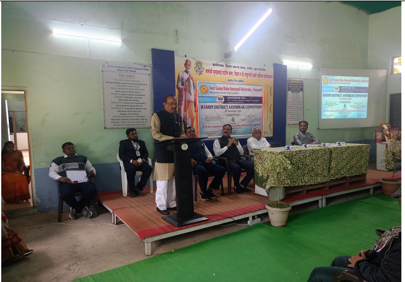
Hon. Arvind D. Ingole delivered Presidential speech