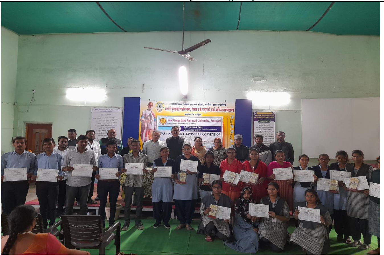
Winers of the Washim District Aavishkar 2023