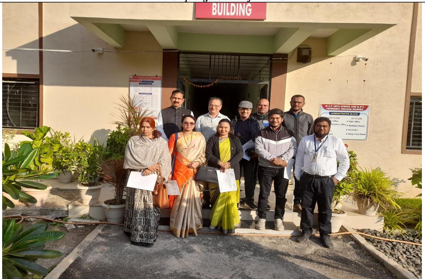
Jury Members along Principal & District Coordinator